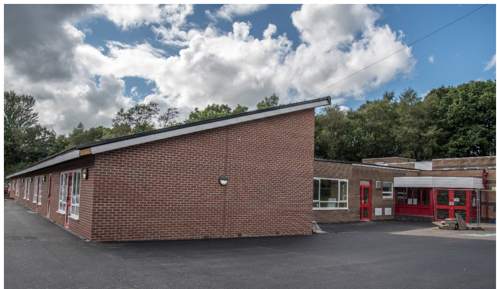
Our newly enlarged Primary School