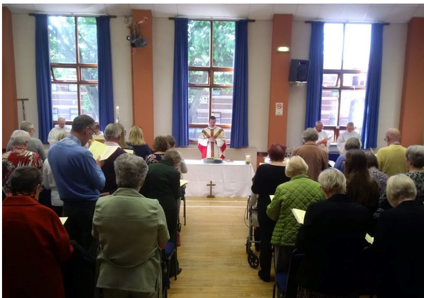
Sunday Eucharist in the Church Hall

Regular maintenance is undertaken within the Church and Church Grounds. We are fortunate to have a small Volunteer Maintenance Team to help with these activities. Our Quinquennial is due to be undertaken next year.