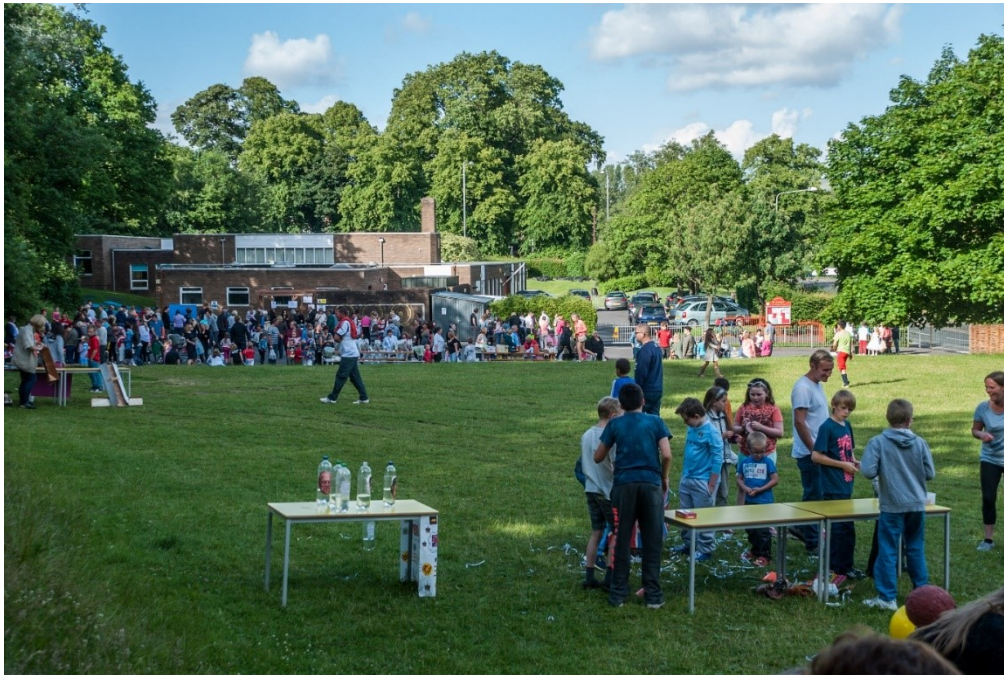
School Summer Fair

We are looking for a Vicar to build on this strong baseline and play a full and active role in the future development of the School and its pupils.