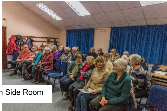
Meeting in Side Room

The building is well maintained and is in a good state of repair. The Church Hall is well used by many organisations, including non-Church groups which contribute to the promotion of community cohesion and extended mission.