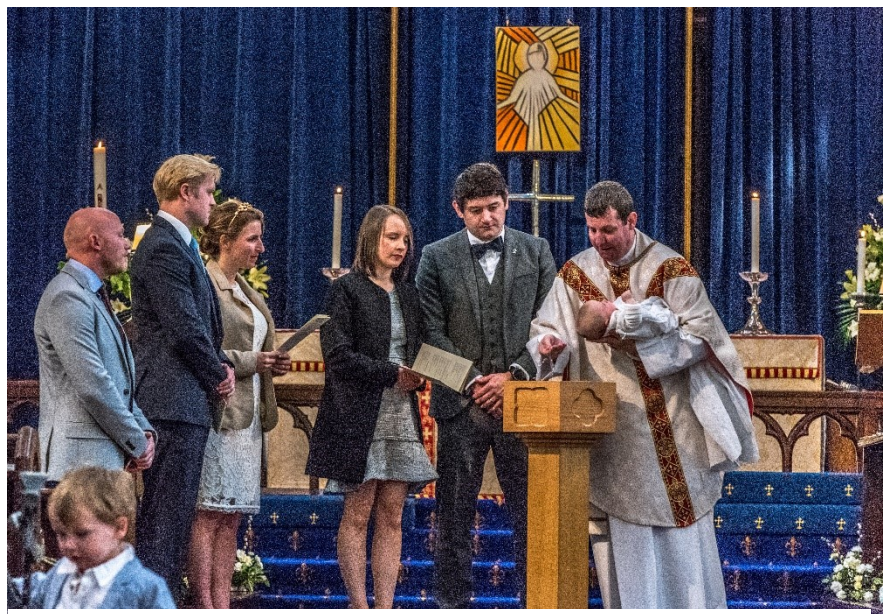
A recent Baptism in Church

An incoming Vicar can look forward to a very supportive and welcoming environment. We are keen to move towards developing our vision, and believe that St George's Church and Parish provide an excellent opportunity to the right person. We are excited about the spiritual growth that this appointment will bring to the future of our Parish.