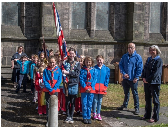
Preparing for Parade Sunday

in line with the Common Worship materials, in that the Service follows a predictable structure.