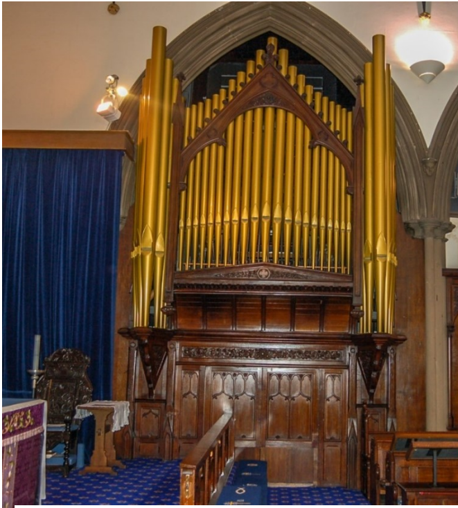
Our magnificent Organ

St George's has a large, active congregation, with a high level of involvement in worship. We have dedicated teams of sidespersons, servers, lay assistants, readers and intercessors. These are supported by wider contributions from, for example, the Verger, a baptism coordinator and St George's Flower Guild which links to the Church of England Flower