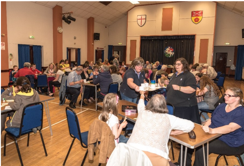
Fund raising event

We have a fairly solid Stewardship base accounting for about 40% of our annual income. No active Stewardship campaigns have been undertaken in the last few years while we have been focused on raising money for our Restoration Fund. It is planned that a Stewardship campaign will be held in 2018 when our current phase of restoration work is completed in December 2017.