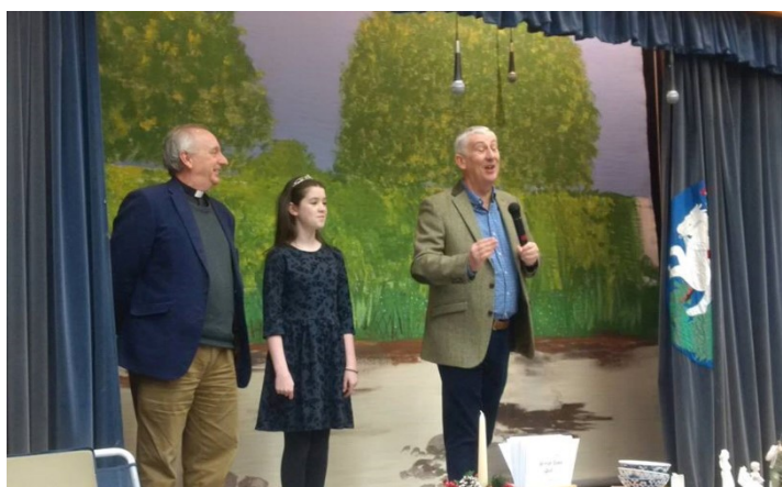
Our MP opens our Christmas Fayre

South Ribble NHS Trust has hospitals at Preston and Chorley (the latter currently only having a 'walk in' emergency facility rather than a full A&E). Whilst Chorley Hospital is not in our immediate Parish, members of our Congregation unfortunately need to use the facilities there or in Preston from time to time.