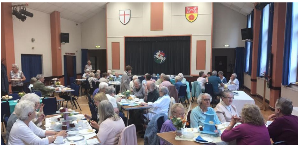
Mothers' Union Eucharist and Social Event

At our Services, the Servers wear Albs and at Eucharist the Celebrant wears a Chasuble - with a Cope worn for Weddings and special occasions.