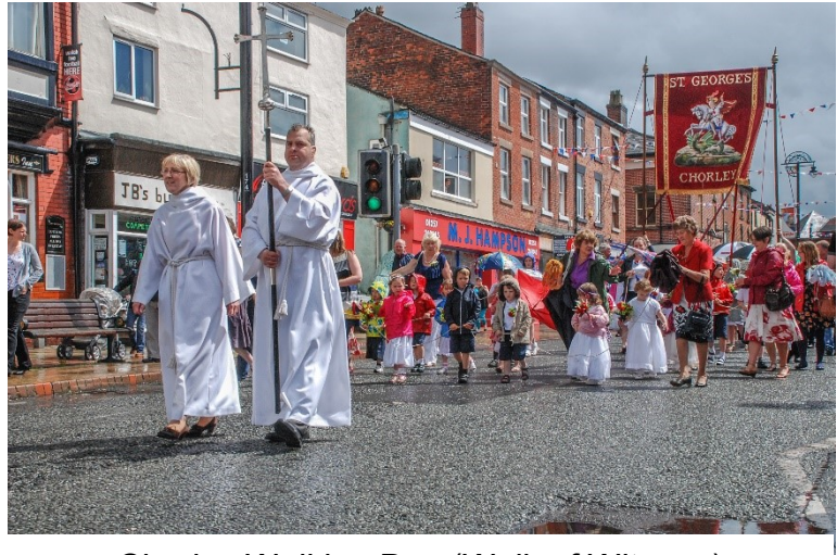
Chorley Walking Day (Walk of Witness)

Both the train and bus stations are located within 150 metres of Church to the east and the town centre is encompassed within a similar distance to the north and west.