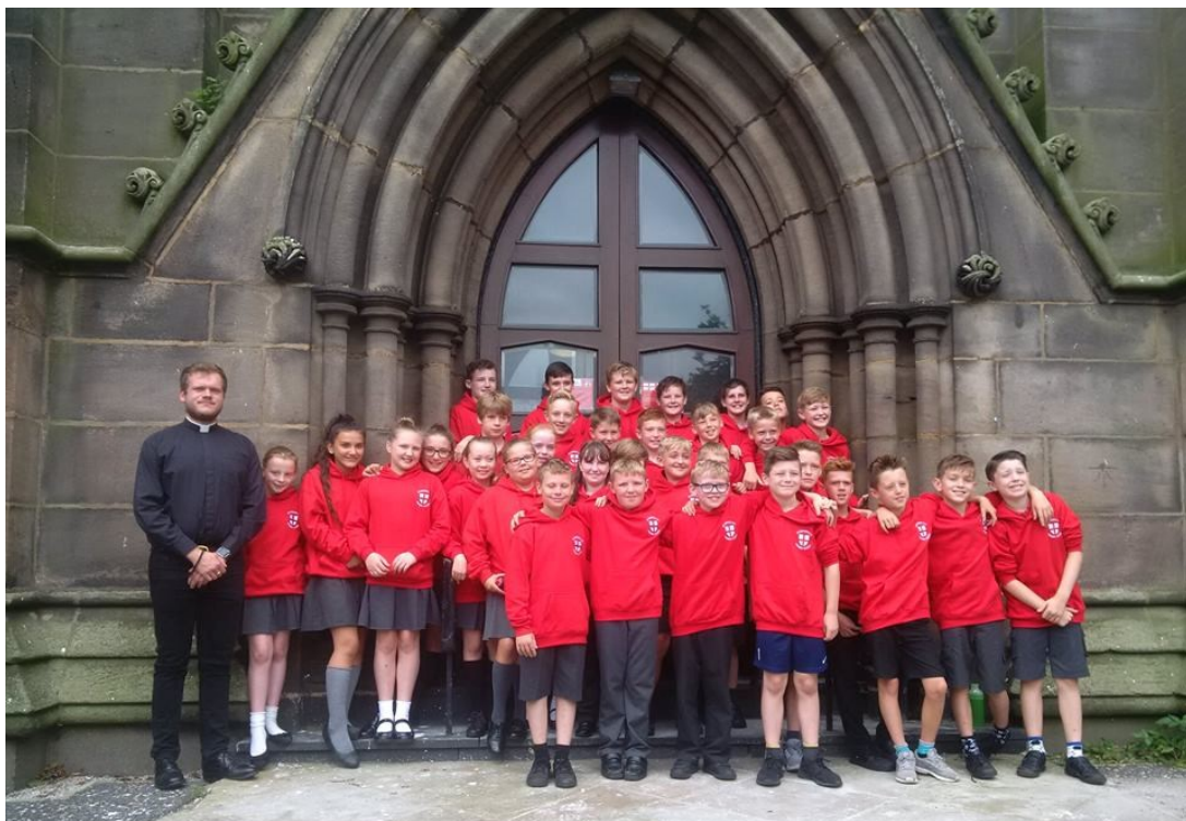
Getting ready for Wednesday Morning Service

The caring, inclusive nature of the School nurtures and supports all pupils. It actively promotes their very good spiritual and personal development and well-being."