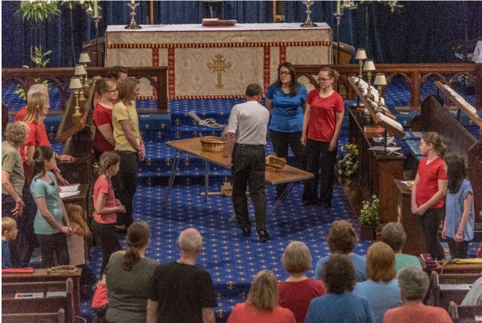
Passion Play during Holy Week

Evensong is held monthly on a rota basis using different Churches in Chorley with a combined Chorley Churches Choir.